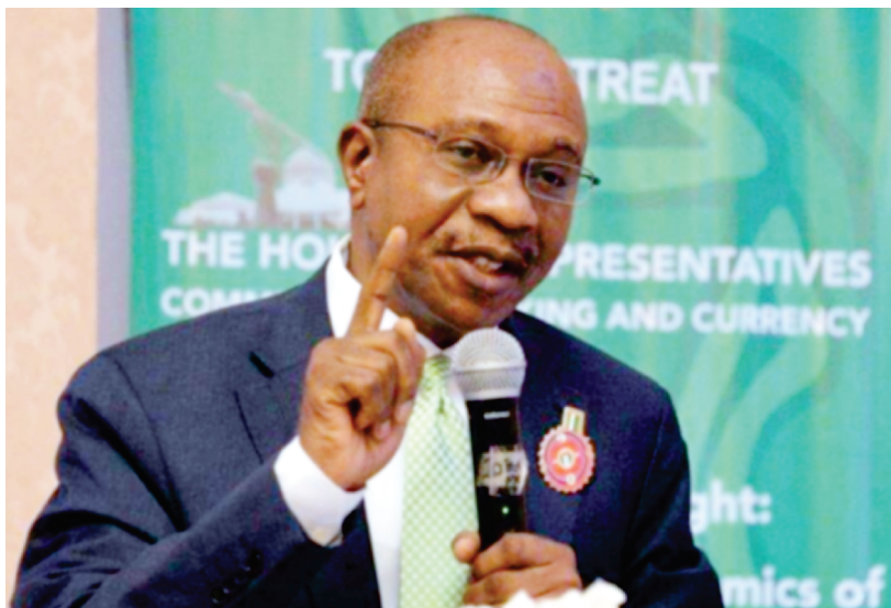
CBN Governor, Mr. Godwin Emefiele addressing Members of House of Representatives Committee on Banking and Currency

T he Governor, Central Bank of Nigeria (CBN), Mr. Godwin Emefiele, has taken his message of economic patriotism to members of the House of Representatives, who he urged to support the drive by the Bank and the fiscal authorities to ensure diversification away from crude oil.