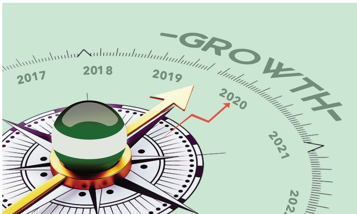
Growth as Priority for 2020

By: Kenekchukwu Afolabi & Senmial Senlong