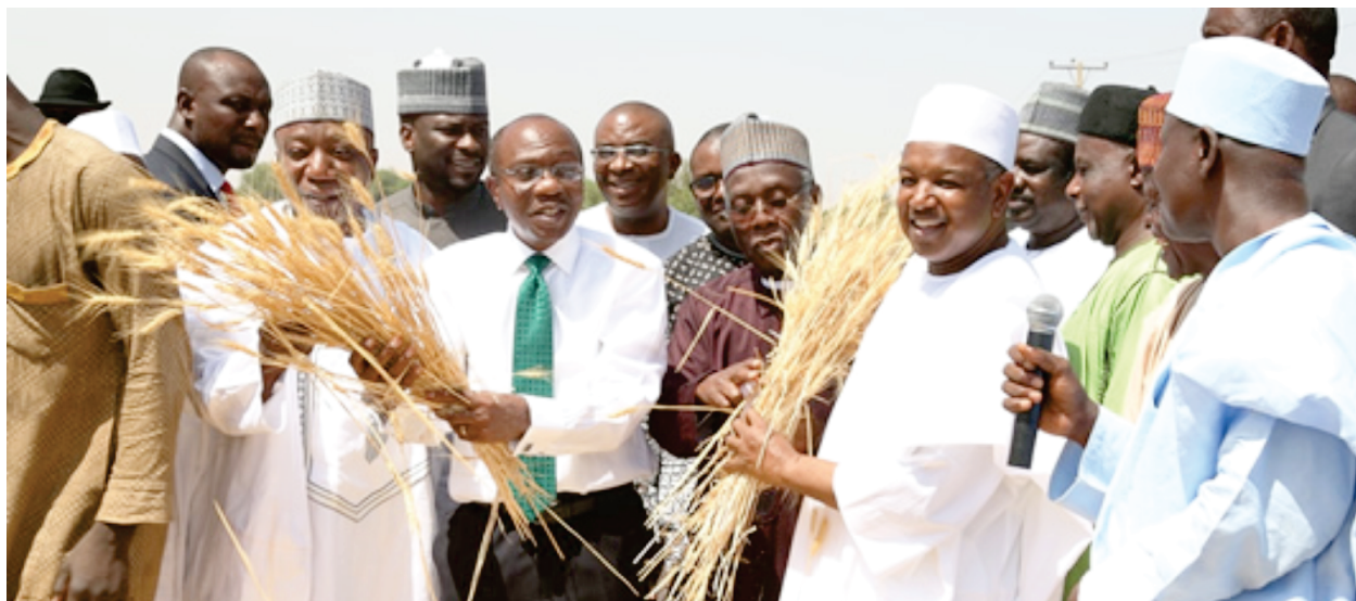
Intervention to Boost Rice Production

In a bid to end the importation of foreign rice, improve quality of local rice and reduce the cost of production, the Central Bank of Nigeria (CBN) is set to avail Nigerian farmers with access to funding to revive local rice industries in Nigeria.