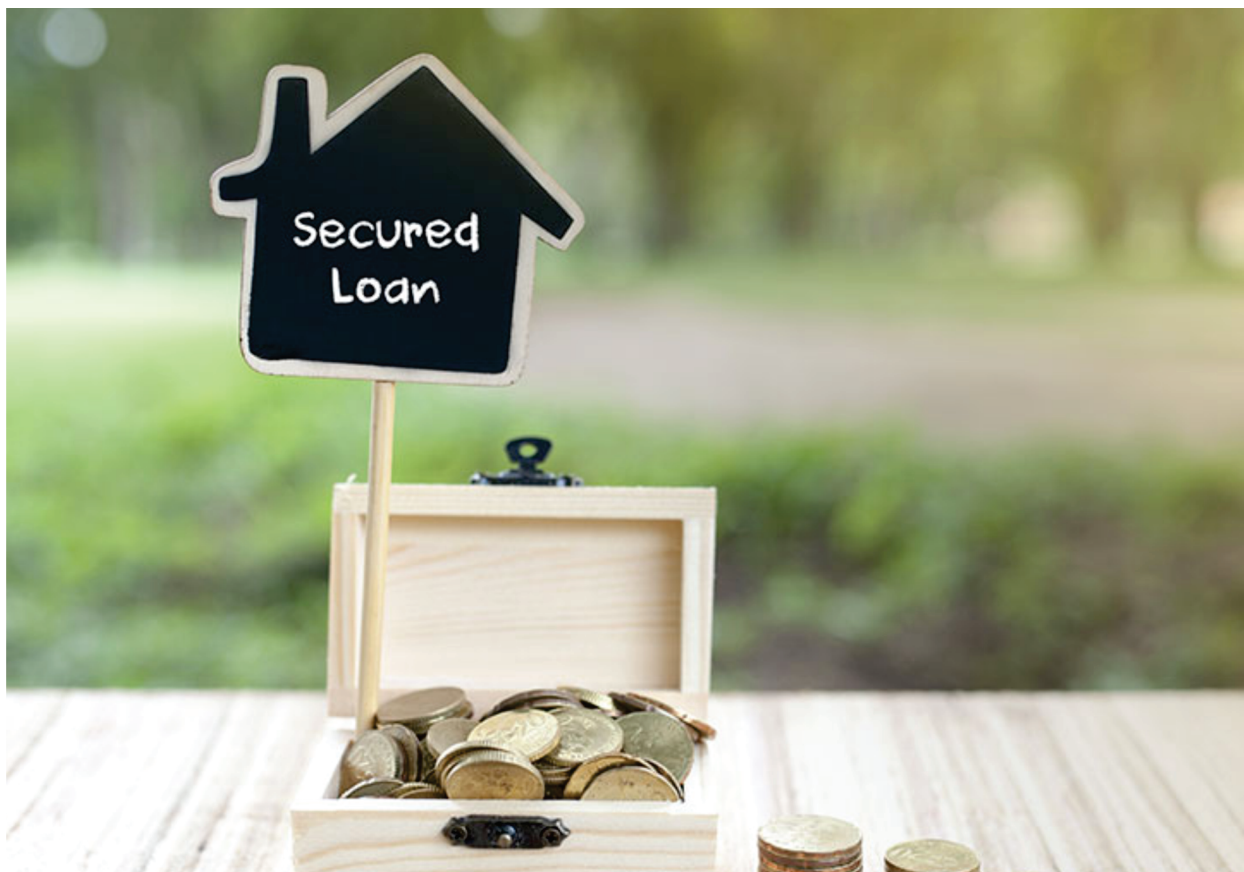
Increase on Secured Lending

The Central Bank of Nigeria's mandate to nurture an efficient monetary and financial system has been boosted by an affirmation from money lenders that there has been an increase in credit and demand for secured lending. The development includes credit conditions, secured and unsecured lending to households, lending to public non-financial corporations (PNFCs), small businesses and other nonfinancial corporations (OFCs) in the last quarter of 2019.