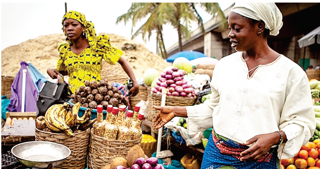
Higher Domestic Production

T he Governor, Central Bank of Nigeria (CBN), Mr. Godwin Emefiele, has outlined the Bank's areas of focus for 2020 to include support for higher domestic production.