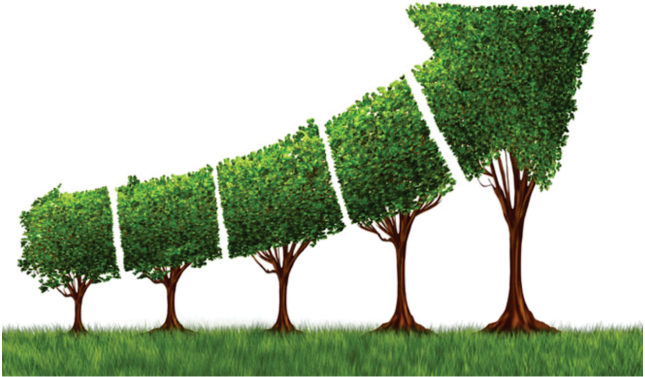
Consolidating Sustainable Growth

It was obvious that when the Governor of the Central Bank of Nigeria (CBN), Mr. Godwin Emefiele, embarked on some unconventional monetary policy initiatives during the time the economy ran into troubled waters and slipped into recession, he knew what he wanted. His policy direction received flaks from within and without. Some international media referred to his monetary policy action as "Toothpick Monetary Policy", while at home economic voodooists ran riot with unrealistic formulations.