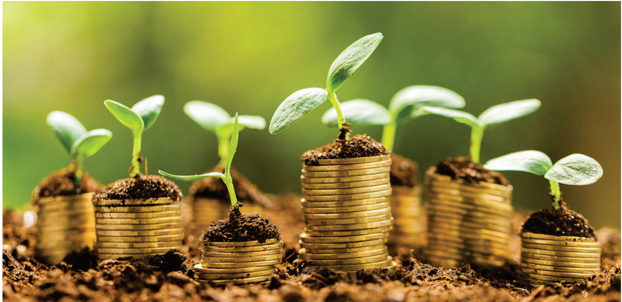
Boost for Microfinance Banks

The Central Bank of Nigeria (CBN) expects a bigger and more robust platform for microfinance banks (MFBs) in Nigeria by the year 2020 as part of efforts to improve the business processes and build capacity for the institutions.