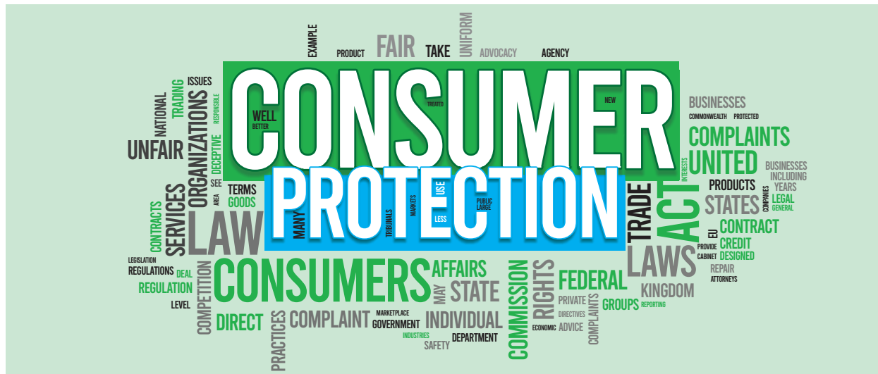
Consumer Protection Regulations

The Central Bank of Nigeria (CBN) has put in place consumer protection regulations to implement the principles prescribed in the consumer protection framework issued in November 2016.