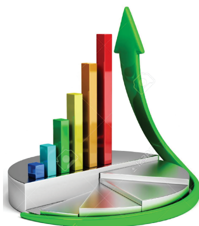
Consolidating Sustainable Growth

No wonder at the 54th Annual Bankers' Dinner, the Governor announced the formation of another initiative of the Bankers' Committee, the establishment of Bankers Charitable Endowment Fund, instituted to fund strategic charitable initiatives in States and Local government areas in the country every year.